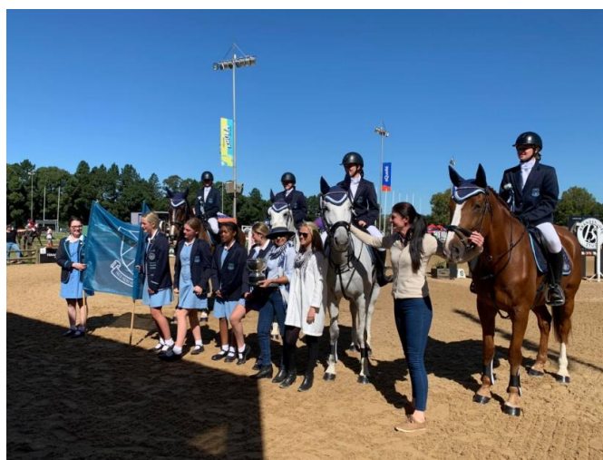
Pictured here are St Anne's - winners of the A.C. Smith Rose Bowl for the KZN Interschools 2022 team turnout.